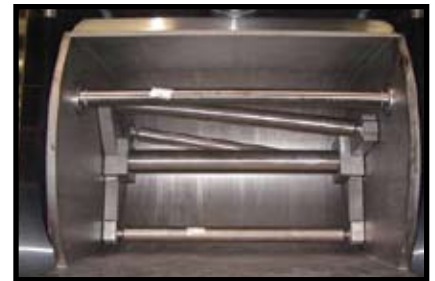
Optional Y-T Agitator