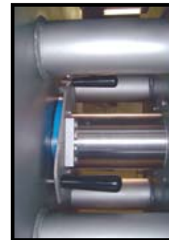
Sanitary Main Shaft Seal