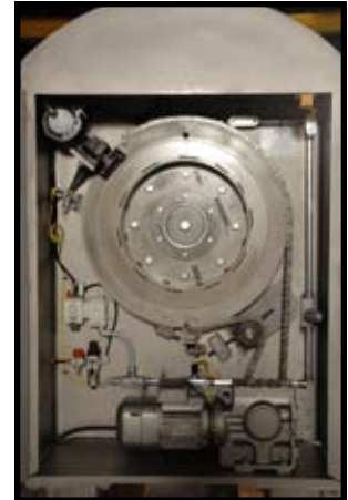
Mechanical Tilt Mechanism