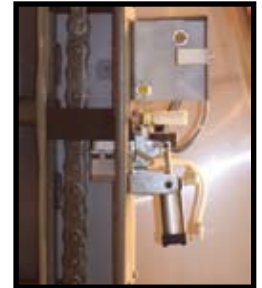
Safety Latch Engaged