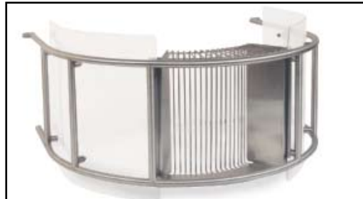
Stainless Steel Bowl Safety Guard