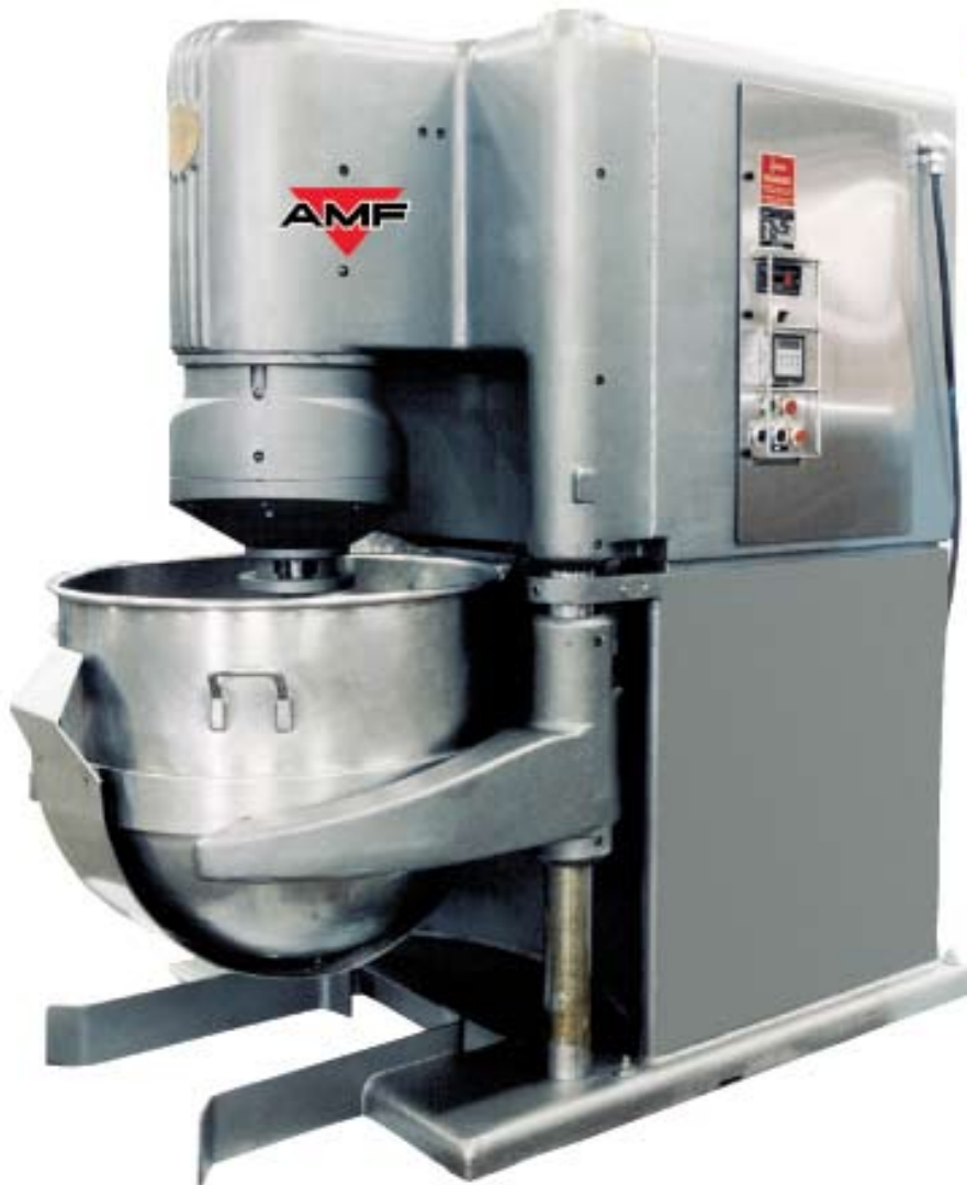
Shown Without Guard