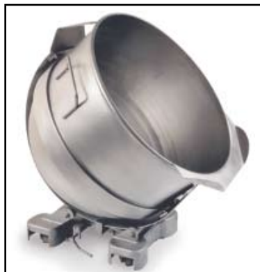
Stainless Steel Bowl and Dolly