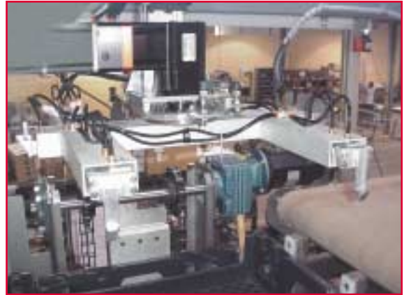
IntelliPlace Four Axis Servo