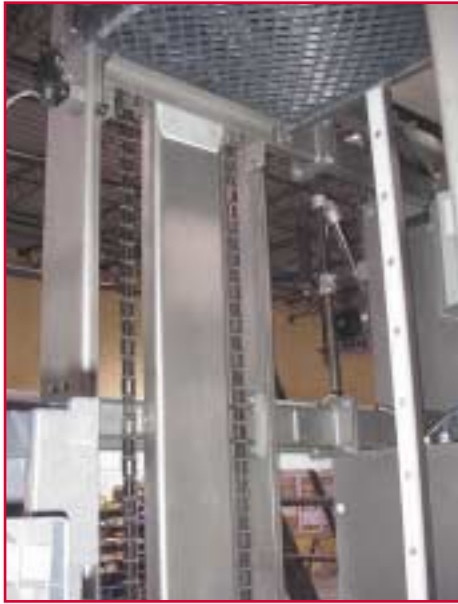
Servo Driven Flighted Elevator Basket Lift