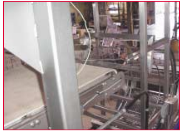
IntelliPlace Discharge Conveyor