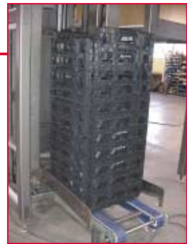
IntelliPlace Infeed Conveyor