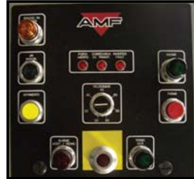
Operator Control Station