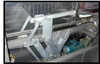
Pendulum Scoop Drive