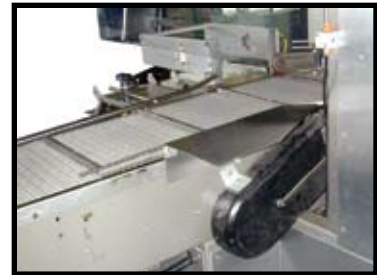
Flusher Discharge Conveyor