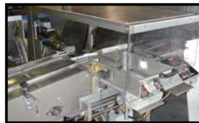
Automatic Dual Wicket Changer Option