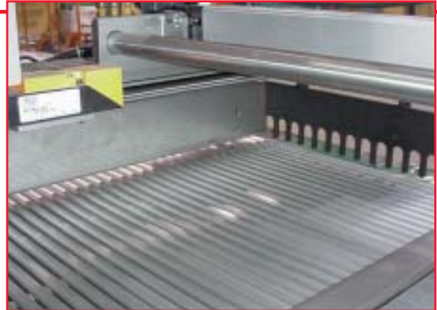
Loader Pusher Assembly