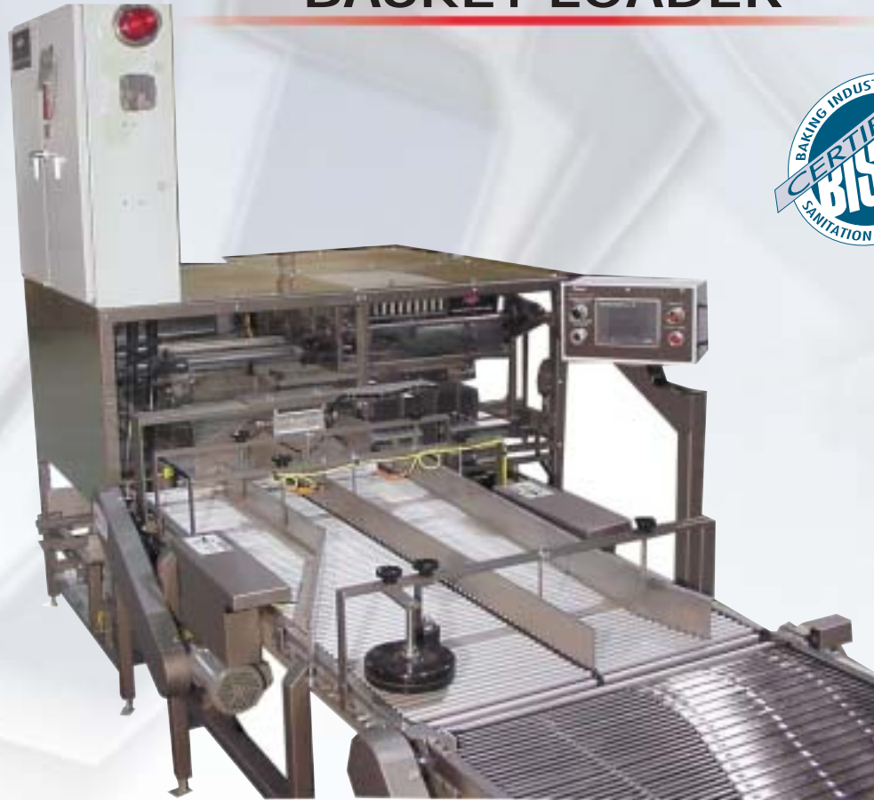
Optional Operator Interface Shown