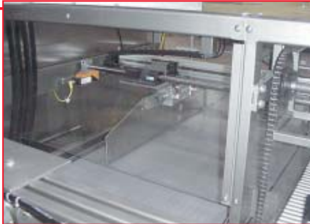
Right Angle Pusher Assembly