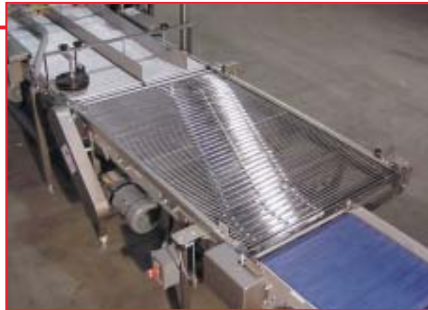
Select-a-Flow Horizontal Product Diverter