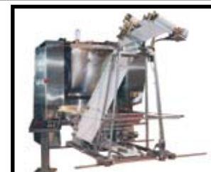
Optional Dough Elevator Showing Swing Away Feature