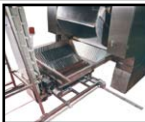
Optional Lateral Traveling System