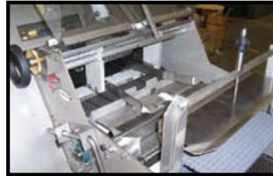
Flight Pusher Infeed Conveyor