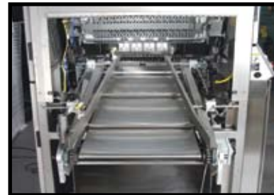
Extended Discharge Conveyor Guide Rails