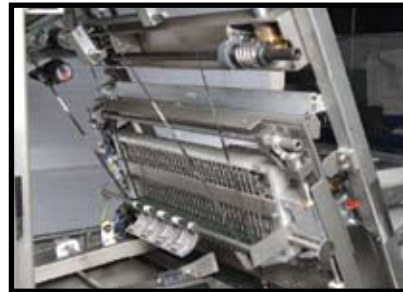
Heavy Duty Lattice