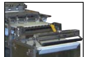
Roll Cutting Section