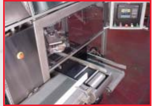
Compact Design fits any Layout