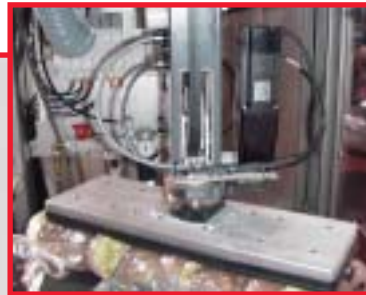
Rotary Servo Axis for Alternating Patterns