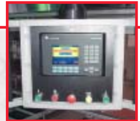
Simple Controls and Two Minute Changeovers